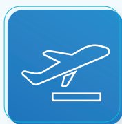
Permanent Departure from HK