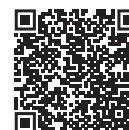
Master Trust Deed