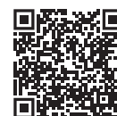
MPF Scheme Brochure

For details of Principal MPF Scheme Series 800, please refer to the MPF Scheme Brochure ( principal.com.hk/sites/default/files/general-files/S800_E.pdf ) and the master trust deed ( principal.com.hk/sites/default/files/general-files/S800_Master_Trust_Deed.pdf ) of Principal MPF Scheme Series 800.